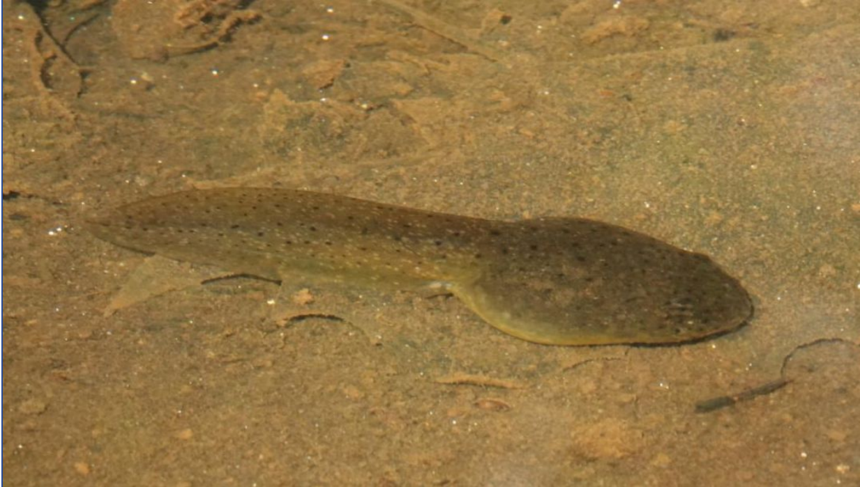
Tadpole (likely American Bullfrog) at the Beltway ponds on April 17 (Hugh Rand)