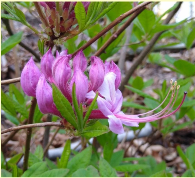
Pinxter Flower (wild azalea) along the Parkway near Maple Avenue on April 22 (M. Wilpers)