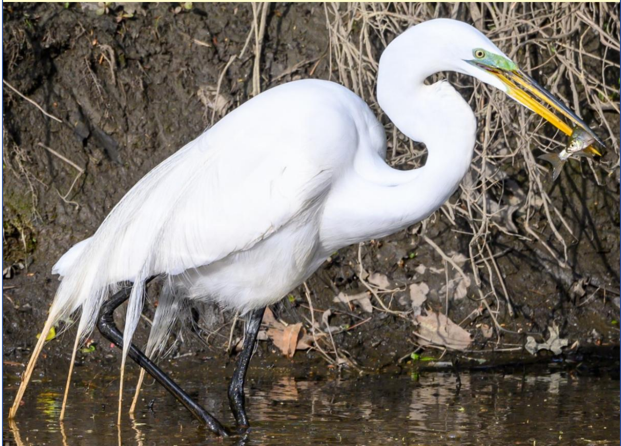
Great Egret with fish catch at the Wheaton Branch ponds on April 21 (S. Davies )