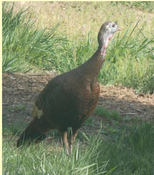
Above: Wild Turkey near Dearborn and Garwood on April 16 (insa) Right: Dekay's Brownsnake near the powerline meadow on April 13 (marsrevolt)