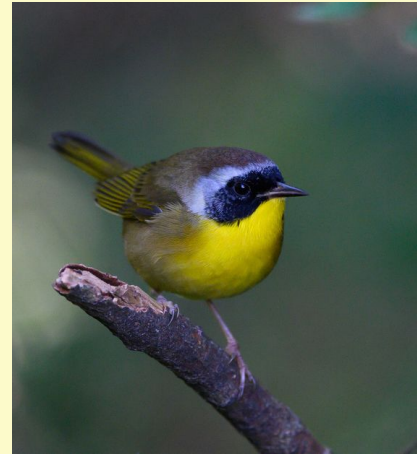
Warblers photographed in Sligo in mid-May 2021

Left to right: Black-throated Blue Warbler, Yellow Warbler, Common Yellowthroat