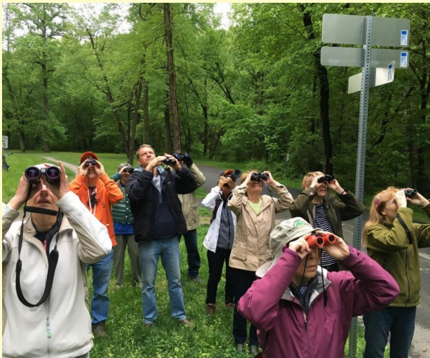
Bird enthusiasts at our outing in May 2017

Celebrate International Migratory Bird Day with outings on May 14 and 15 to look for the many colorful birds who pass through on their way north, as well as those who are arriving to nest and breed in Sligo.