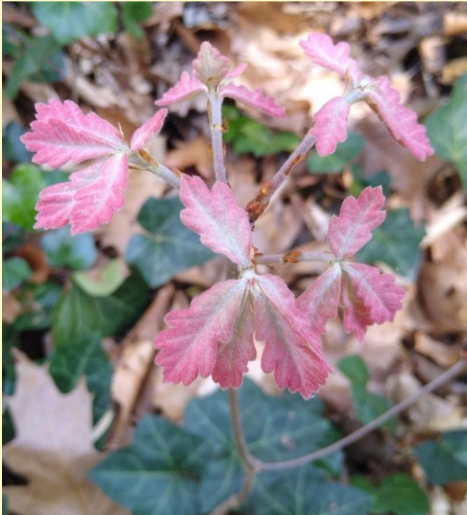
Black Gum (above) and White Oak (right) leafing out in the park near Kennebec April 17 (Wilpers)