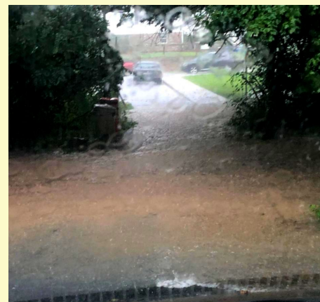
Flooding on Takoma Park streets in September 2020