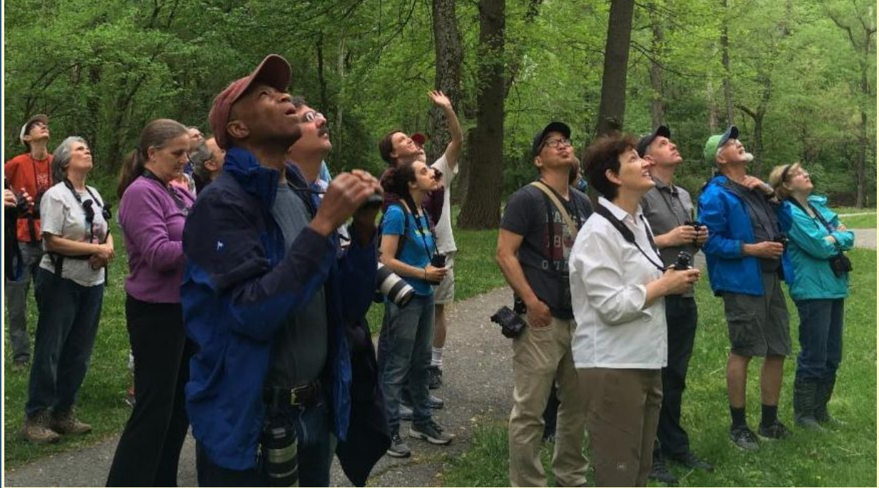
Attendees at our May 2018 bird outing