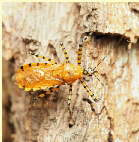
Above: Orange Assassin Bug near Hilltop and Mississippi on April 8 (Katja Schulz) Right: Tree Swallow at the Kemp Mill stormwater ponds on April 22 (Dan Treadwell)