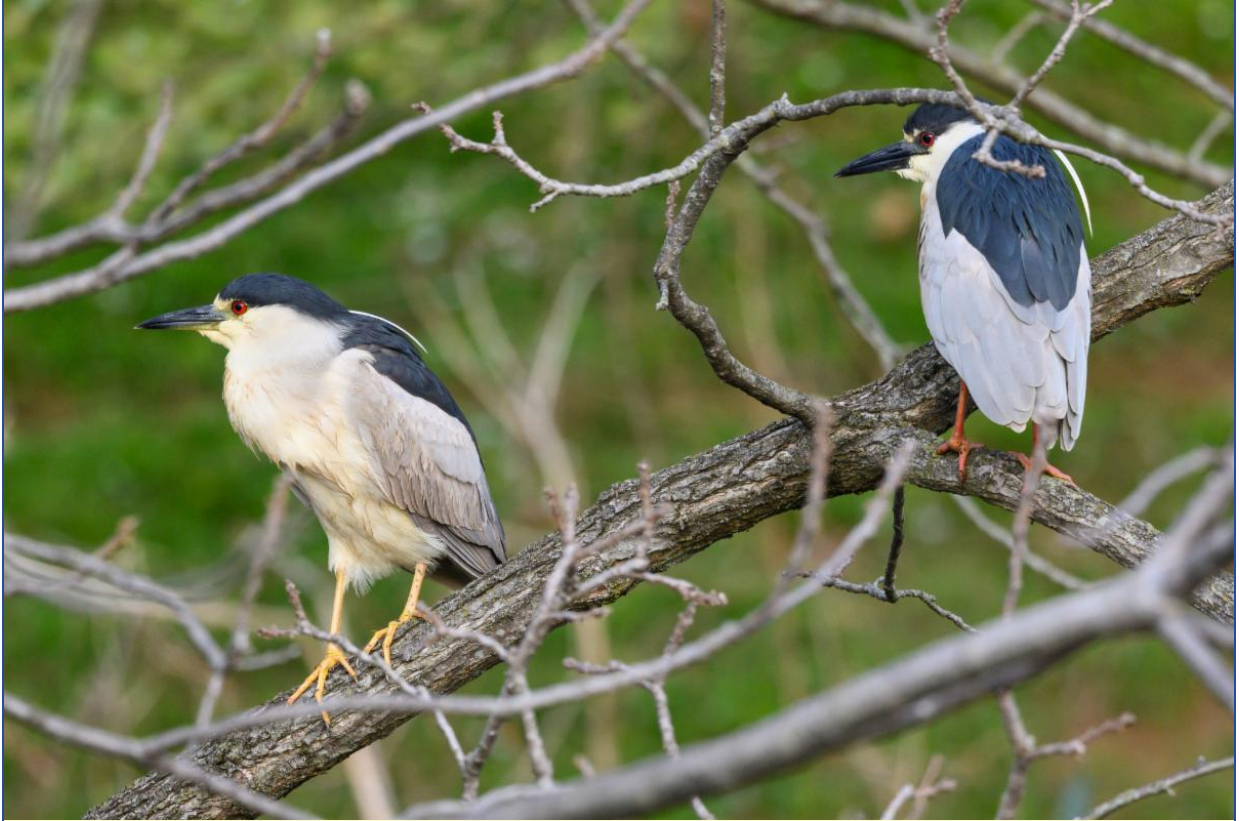
Black-crowned Night-Herons at the Wheaton Branch ponds on April 22 (S. Davies)