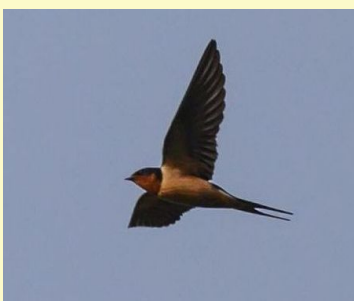
Barn Swallow at the Wheaton Branch ponds on April 13 (S. Davies)