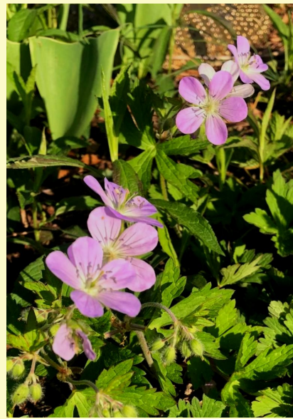
Wild Geranium in Carole Highlands on April 23 (K. Zimmer)