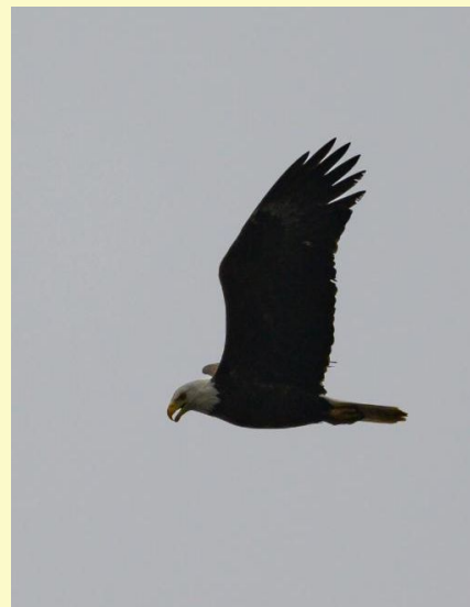
Bald Eagles at the Kemp Mill stormwater ponds on March 23 (left,)