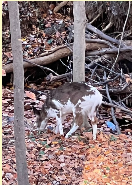
Right: A very rare piebald White-tailed Deer near Mississippi and Hilton on Nov. 1