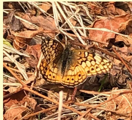
Two life stages of the Variegated Fritillary butterfly: