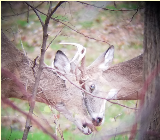
Above: Two young male White-tailed Deer (8- and 6-point) at play near Long Branch at Carroll on Dec. 17 by jimdella.