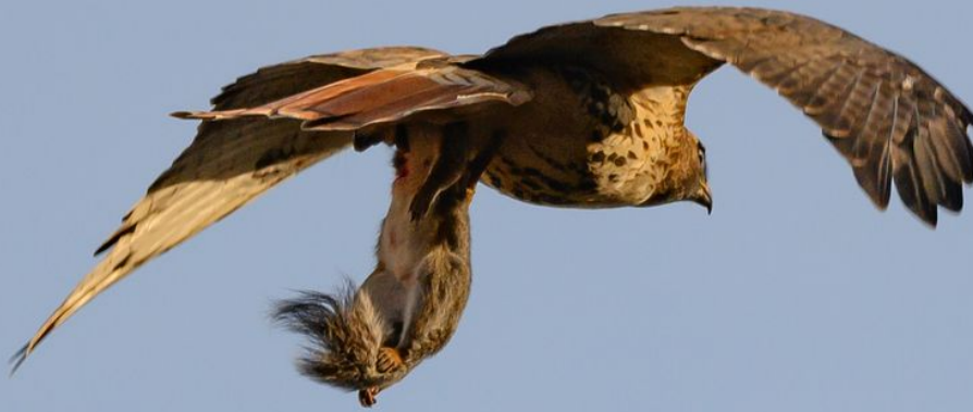
Red-tailed Hawk with squirrel prey above the Wheaton Branch ponds on Nov. 20