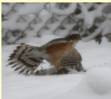
Three hawks with prey in Sligo: Above: Cooper's Hawk struggling with European Starling near Franklin & Sudbury