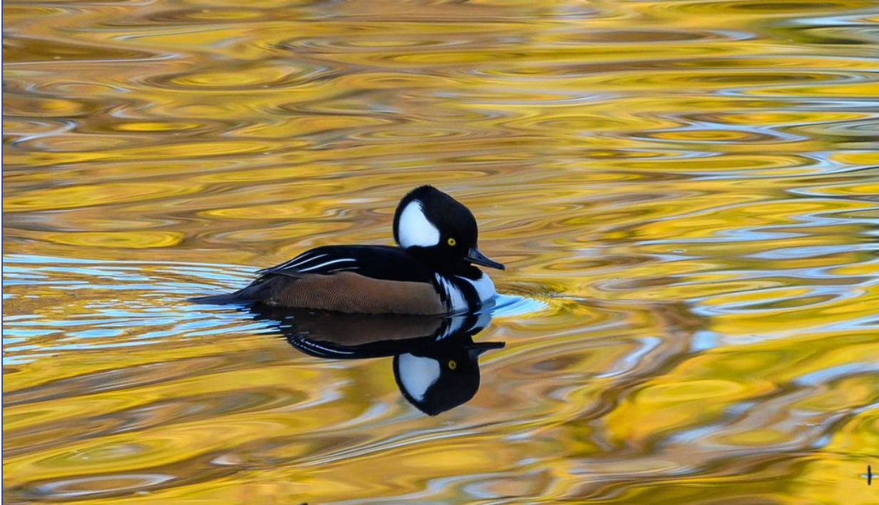
Hooded Merganser on the Wheaton Branch ponds on Nov. 20