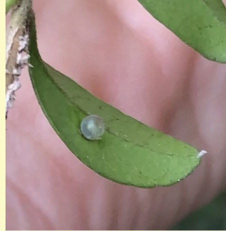
Above: Egg of insect in the subclass Pterygota on a privet species in Carole Highlands on Jan. 2