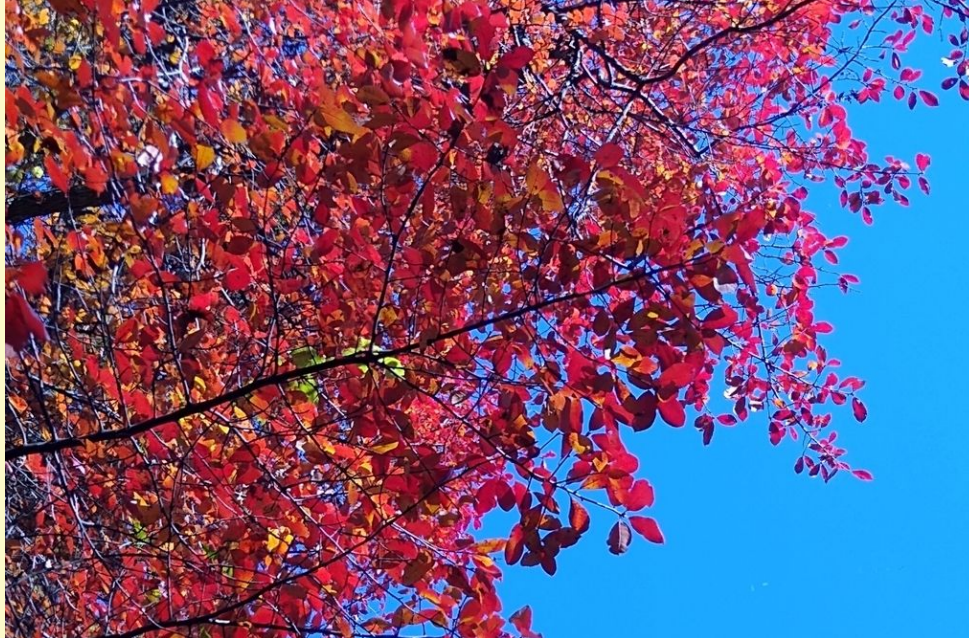
Black Gum (Nyssa sylvatica) along the Parkway just south of Wayne on Nov. 1 by M. Wilpers This species was nominated last fall to be named the official county tree.