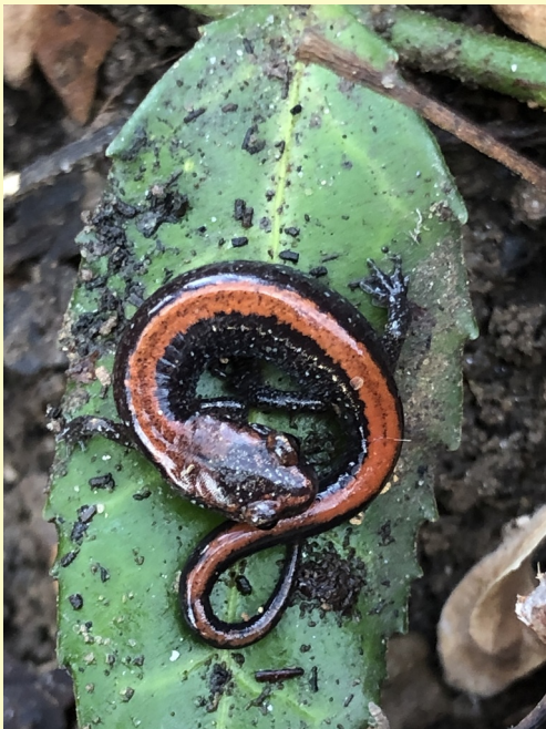
Eastern Red-backed Salamander at Dale Neighborhood Park on Dec. 2