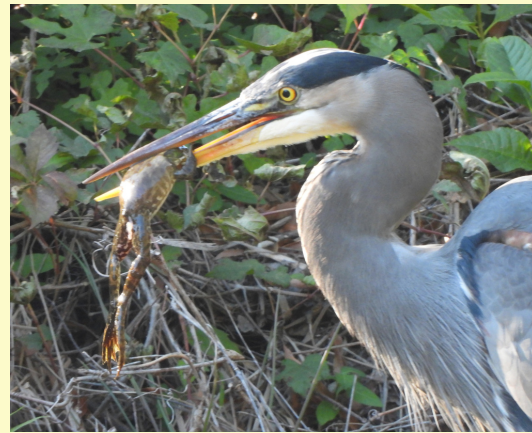
Three more birds with prey: Left: Eastern Bluebird with insect prey at the Wheaton Branch ponds on Dec. 14 Above: Great Blue Heron with American Bullfrog prey at the Beltway ponds on Nov. 8 Below: Belted Kingfisher with fish