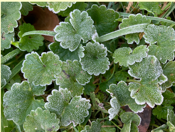
Above: Ground-Ivy at Belle Ziegler Park on Nov. 6