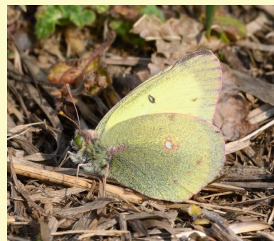
Two late-flying butterflies on Dec. 4: Above: Clouded Sulpher Left: Orange Sulpher Both at Wheaton Branch ponds