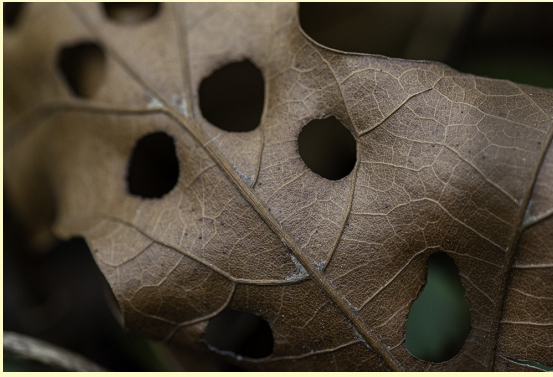
Evidence of fly caterpillars at work:

Above: Openings left by the Oak Shothole Leafminer near Wayne and Cedar on Dec. 17