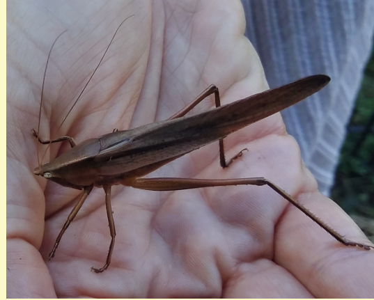
Left: Migratory Grasshopper in the powerline meadow on October 10. Above: A katydid in the genus Common Coneheads near Long Branch Wayne Park on September 30