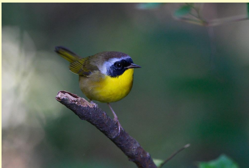
Two gorgeous birds at the Wheaton Branch ponds: Common Yellowthroat (above) and Northern Flicker (right) on October 2