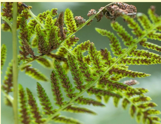
Lady Ferns near Woodside and Alton on September 27