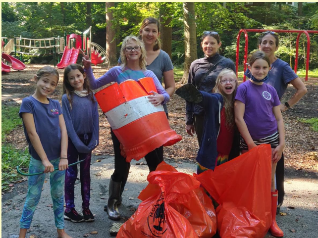
Girl Scout troop 34039 celebrates their haul of trash at Becca Lilly Park in lower Long Branch.