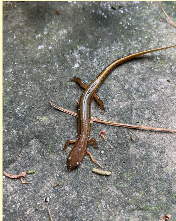
Northern Two-lined Salamander near Sligo Bennington Park on September 30