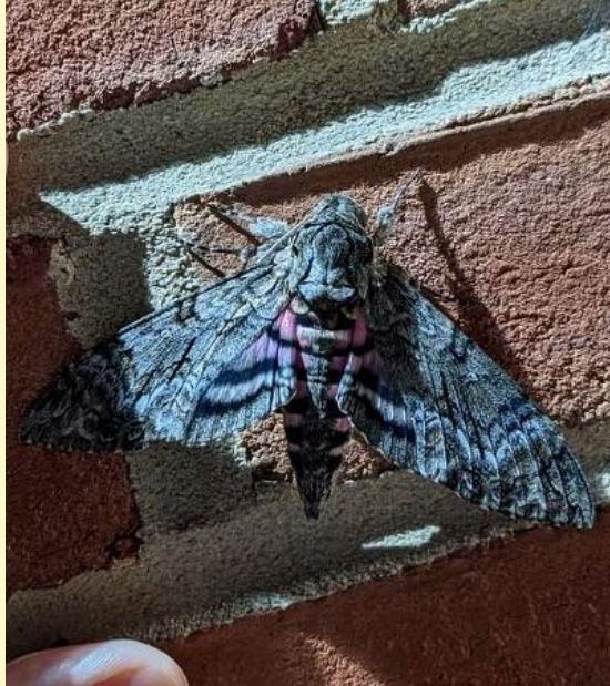
Right: Pink-spotted Hawkmoth at the Takoma Park Library on October 11