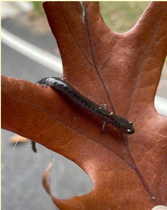
Eastern Red-backed Salamander near the Parkway at Park Valley Road on October 9