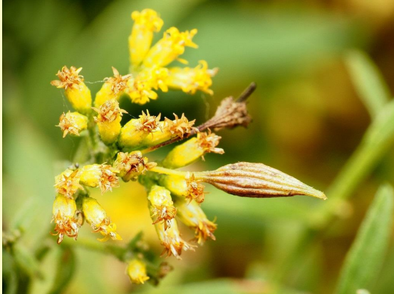
Above: Goldentop Pedicellate Gall Midge in the powerline meadow below NH Ave on October 2