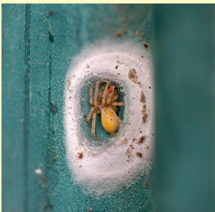
Spider near Wayne and Cedar on October 15 by Maragay (possibly Northern Yellow Sac Spider)