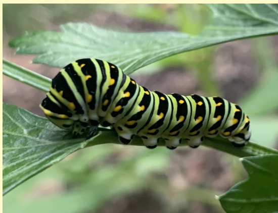
Black Swallowtail caterpillar near Woodland and Grace Church Rd on September 27