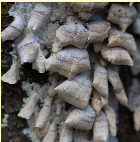
Above: Mushrooms in the genus Trichaptum near Highland & Alton on September 27