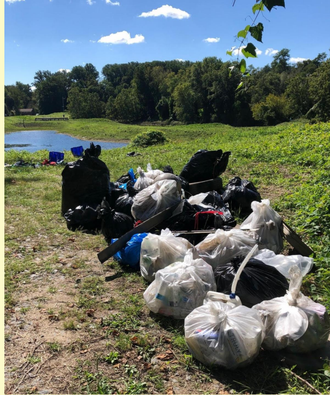
Above right and below: More than 30 volunteers collected more than 30 bags of trash at the Wheaton Branch ponds, including students, young families, and longtime residents. This was our first collaboration on a Sweep with the Dept. of Environmental Protection, which manages the ponds.