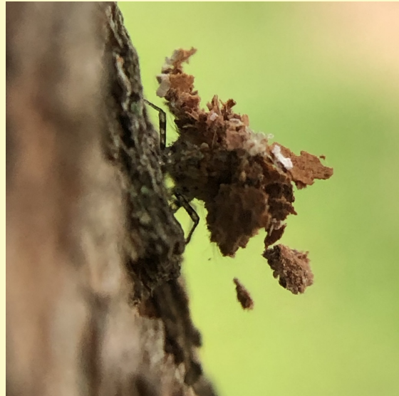
Two insects that, in the larval stage, plaster themselves with plant material as a disguise. Left: Wavy-lined Emerald moth on October 7. Above: Lichen-carrying Green Lacewing on October 21. Both in Chillum