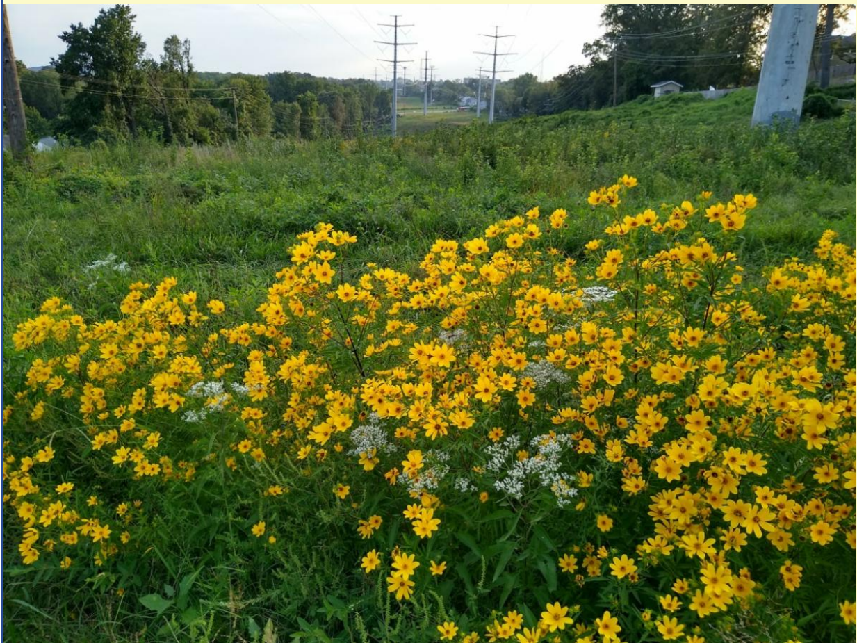
Crowned Beggarticks in the powerline meadow below NH Ave on September 15 by M. Wilpers, looking southwest from the ridge at 16th Place (Also called Tall Swamp Marigold, the scientific name is Bidens trichosperma, formerly B. coronata.)