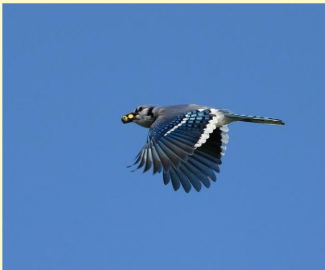
Blue Jay carrying two acorns at the Wheaton Branch ponds on September 29