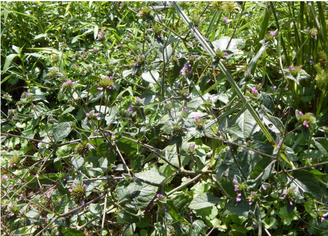
Native Elephant's foot growing in pilot meadow area