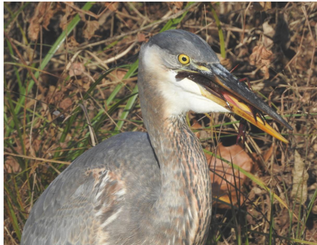
Left: Red Swamp Crayfish (native to the Deep South, invasive in Maryland) caught by a Great Blue Heron on Nov. 29 at the Beltway ponds. Above: The heron just before swallowing the crayfish.

All photos, dates, locations, and names taken from the iNaturalist "project" titled "Fauna and Flora of the Sligo Creek Watershed."