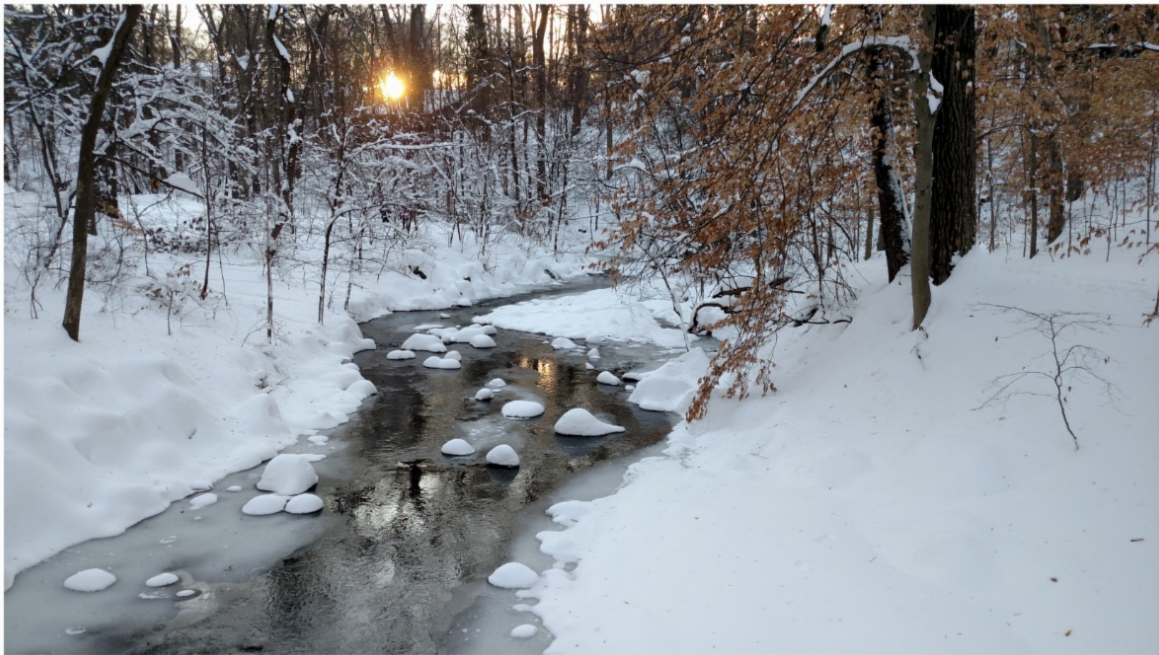
Snowy Sligo