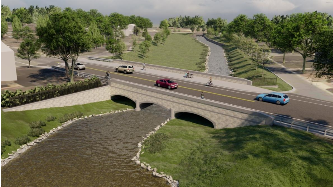
Artist's rendering of the completed project, showing Wheaton Branch, looking north over Dennis Avenue, with flood prevention earth works on either side of the stream and the "open space" option for vegetation (DEP image)

The county's announcement notes that the existing Dennis Avenue bridge, built in 1961, is "in poor condition and is in need of replacement." In addition, the announcement says that houses along Glenhaven Drive, Dennis Avenue, and nearby streets "frequently experience flooding." For more information, see the project webpages: