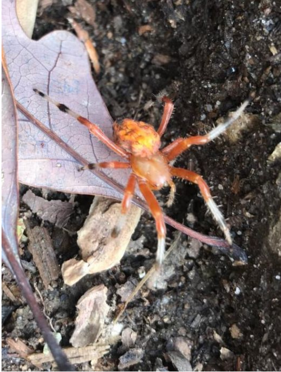
Marbled Orbweaver (above) on Dec. 1 near Flower and the Parkway. Salt Marsh Moth (right) in the powerline meadow on Nov. 2