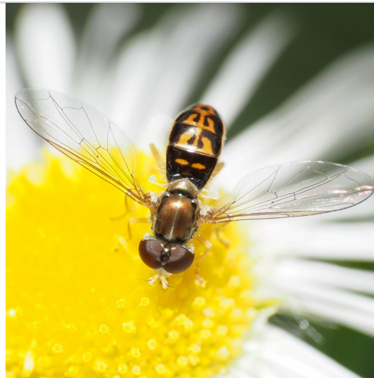
Osage Orange fruit (left) at the Wheaton Branch ponds on Nov. 13. Margined Calligrapher on Nov. 4 near Montgomery College.