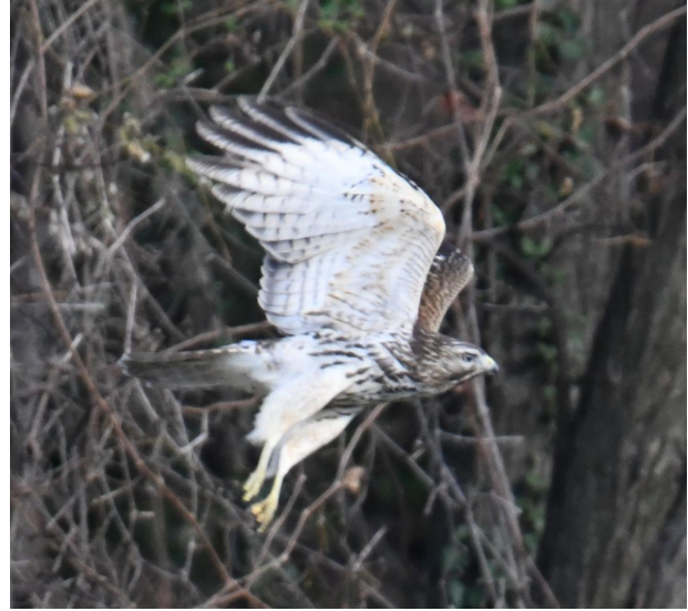
Red-tailed hawks at the intersection of Georgia Ave. and the Beltway Nov. 4 (left, by anonymous) and at the Wheaton Branch ponds Nov. 26.