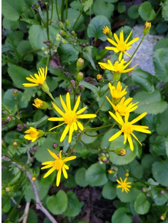
Take a top-down photo of flowers to show the number of petals (or petal-like structures).

For questions or more information about enjoying iNaturalist, contact naturalhistory@fossc.org .