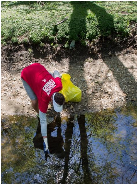
Volunteer in Sligo during a recent Sweep the Creek

will practice social distancing to the extent possible in order to reduce the spread of the coronavirus.