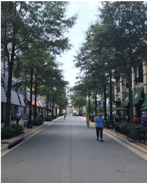
Ellsworth Dr. street mall as it now appears

If you want to submit a comment to the Montgomery Planning Board about the proposal for artificial turf on the Ellsworth Avenue street mall, you must do so before 12 noon on the day before the public hearing on the proposal, which will be either April 16 or 30.