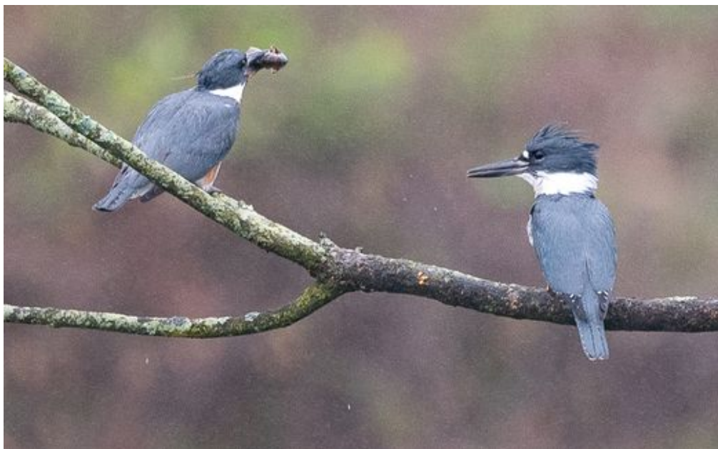
A pair of Belted Kingfishers seemed to follow an avian version of social distancing