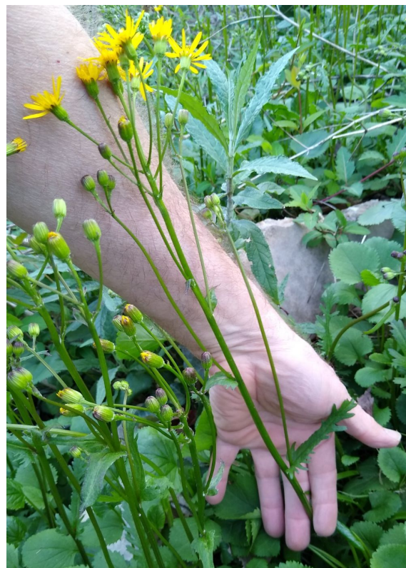
Shoot each plant from a side view to show the arrangement of stalks and leaves. A contrasting backdrop helps the plant's details stand out.