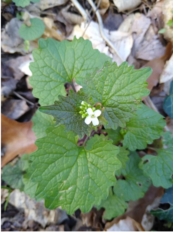
Garlic mustard is a main target of invasives work in April.

pandemic. Montgomery Parks urges users of its parks to practice "social distancing" and apply good judgement.