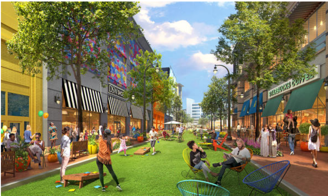
Artist's rendering of the artificial turf installation proposed for the Ellsworth Avenue street mall

If you have questions about submitting your comments, or would like to know of other county officials you might contact, email waterquality@fosc.org .