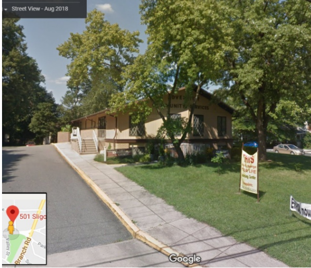
Adventist Community Services on Sligo Avenue