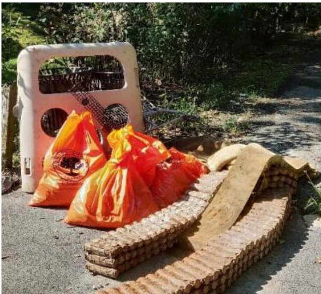
Some of the trash and strange items removed from Sligo during our last Sweep the Creek

Mark your calendars for the next Sweep the Creek on Saturday and Sunday, April 13 and 14.