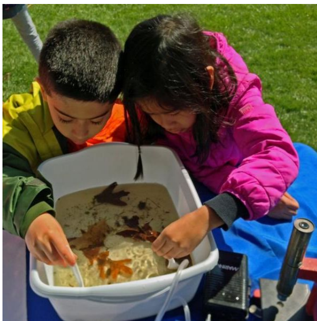
Kids search for critters in stream water at an Audubon Naturalist Society family program.

The event, called "What Lives in Long Branch? / ¿Qué Vive en el Arroyo de Long Branch?" is part of an innovative new program developed by the Audubon Naturalist Society for people living in the Long Branch community.