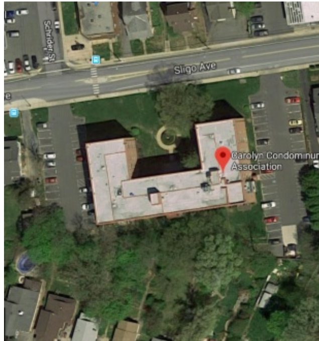
Carolyn Condominium Complex on Sligo Avenue