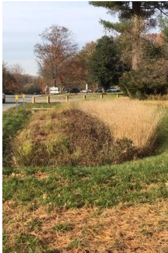
Bioswale along the Parkway at the golf course

Meet at 10 am at the intersection of St. Andrew's Way and Sligo Creek Parkway. You can park on St. Andrew's Way or at the golf course (near the end of the tour), depending on your walking preferences.