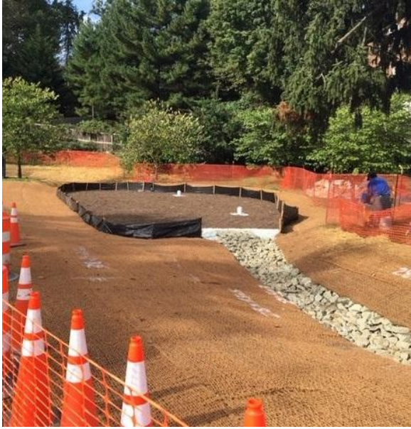
A new bioretention system at the corner of the Parkway and St. Andrew's Way

First on the itinerary (see map at bottom) is a new bioretention facility on the corner of St. Andrew's Way and the Parkway. Next up (no. 2) is the stream stabilization project in the Sligo creek bed (carried out by WSSC as part of a consent decree). Then the group will visit two tributary riparian restorations (at 3 and 4), the site of a future restoration of Edgevale tributary (5), the riparian restoration at Crosby Road (6), bioretentions at the golf course (7), and a constructed wetland to control stormwater from the Beltway (8).