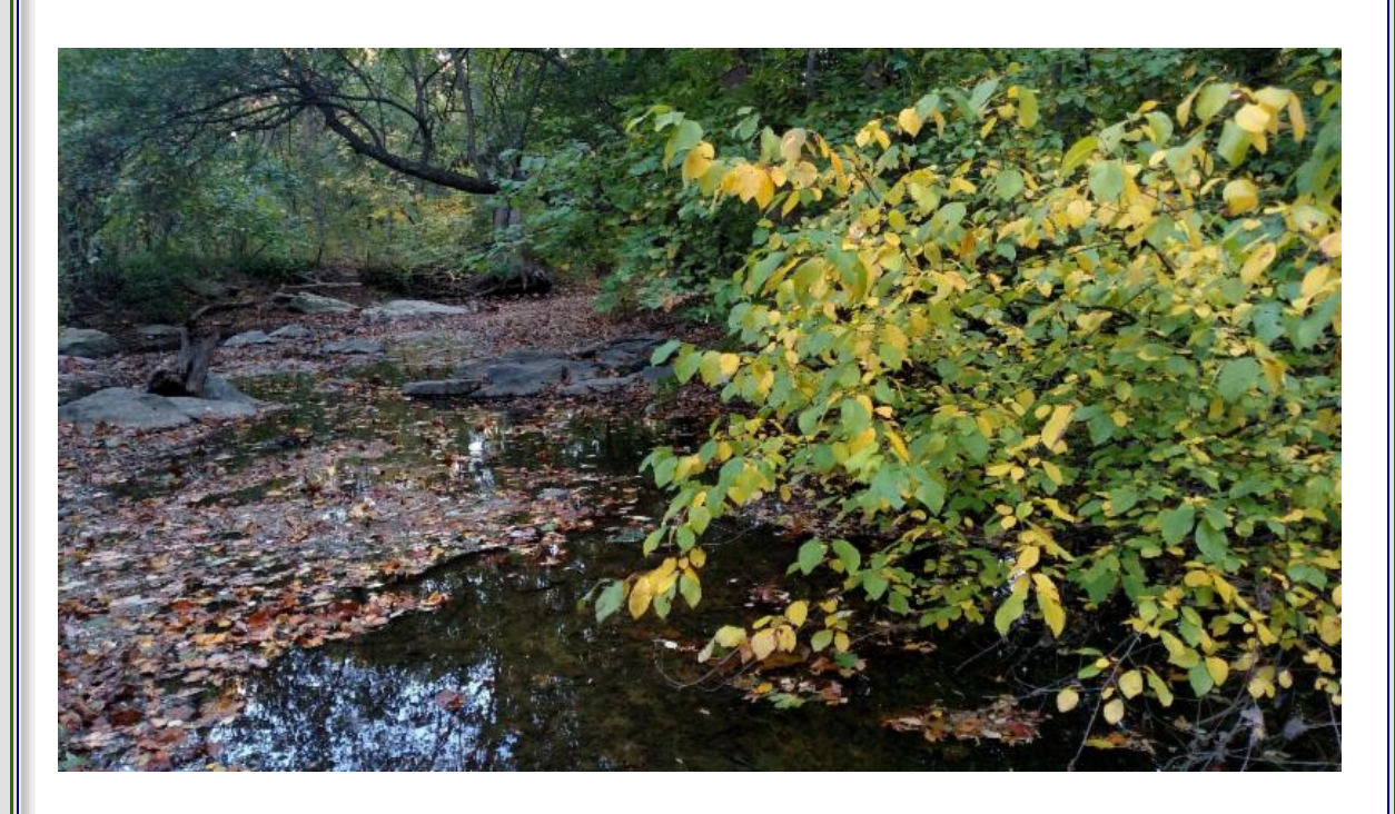
Spicebush along Wheaton Branch in late fall 2016

Your gift this year will be especially helpful as we invest in a new content management system for our website, which, among many other things, will make all the site's rich resources and mechanisms for reporting easier to use on handheld devices.