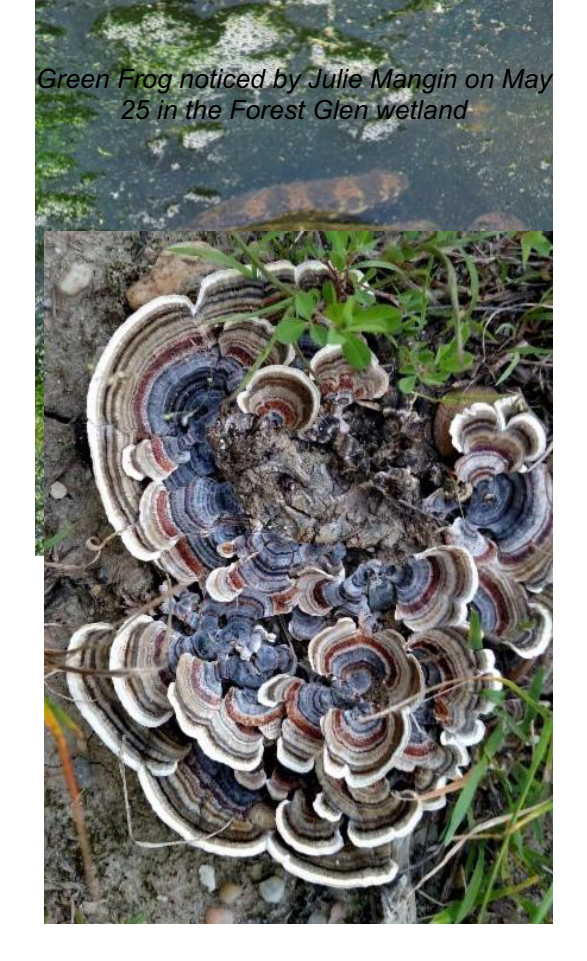
Turkey-tail mushroom growing on cut Chinese pear in Pepco meadow in June