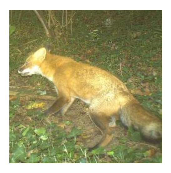
Red Fox caught by Jim Anderson's motion-sensitive night camera near Dale Neighborhood Park in October