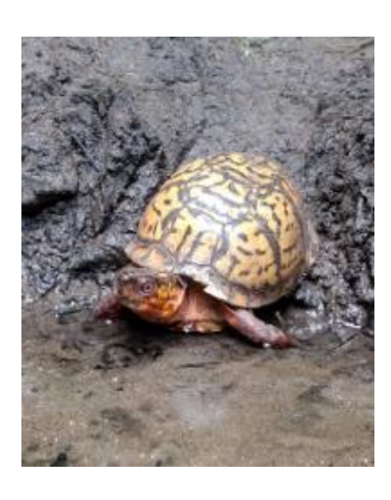
Eastern Box Turtle reported by Doug Stephens on July 13 just below Colesville Road