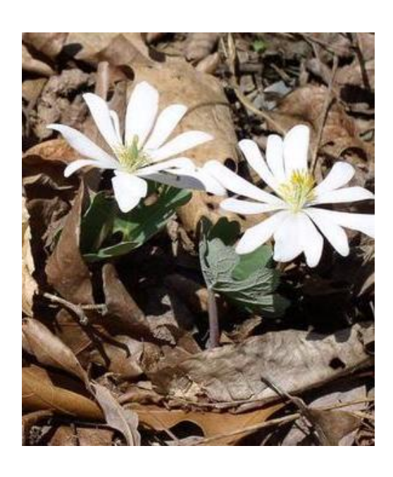
Two of about 100 Bloodroot seen by Laura Mol along Long Branch between the library and community center March

Here are but a few of the photographs included in this year's sightings. To see them all, go to <u>Sightings page</u>. Keep your reports coming in 2017!