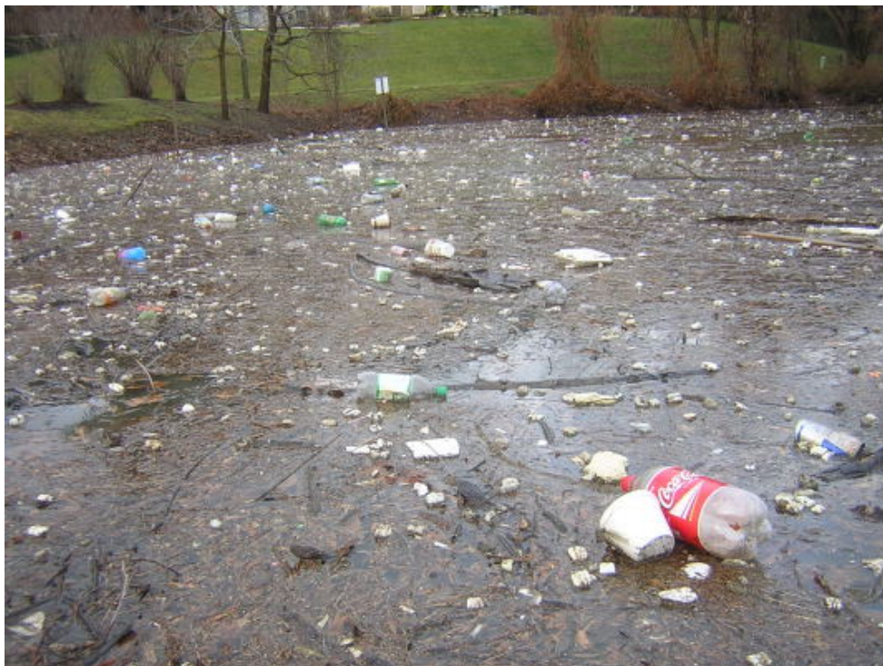
Trash in Sligo Creek Stormwater Pond