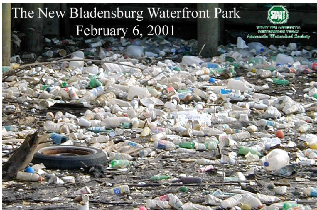
Trash at Bladensburg