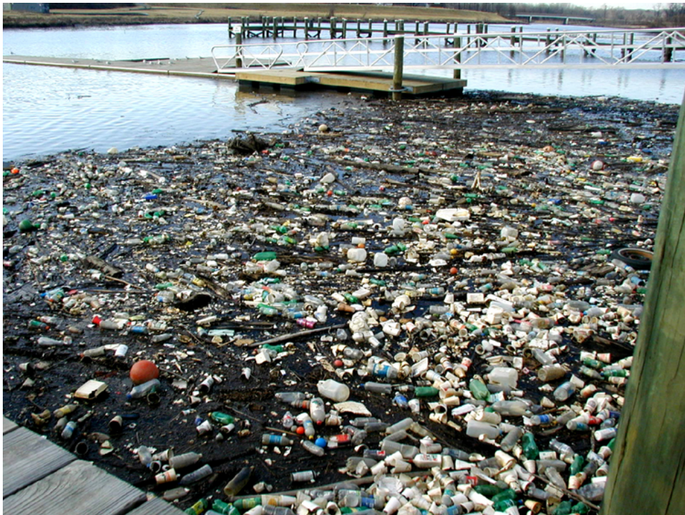
Looking Toward Colmar Manor