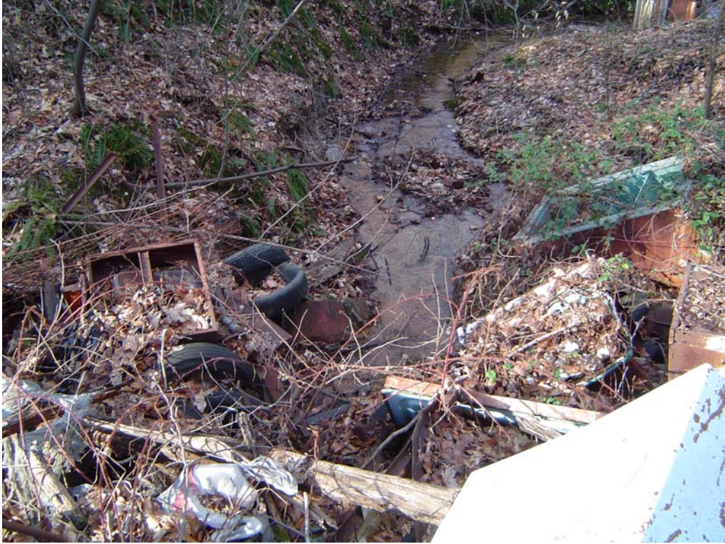
Watts Branch Headwaters