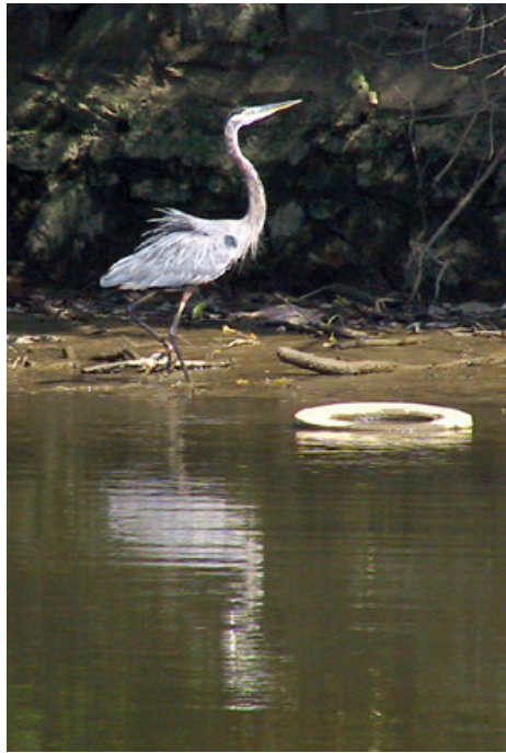
Heron and Tire