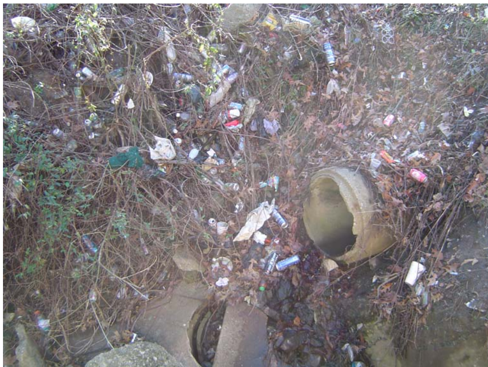
Close-Up of Trash Near Capitol Heights Liquor Store