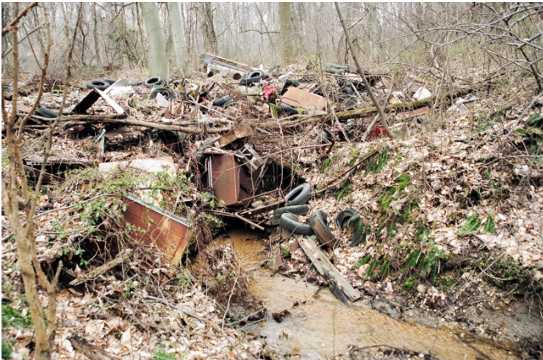
Watts Branch Headwaters (May 2005)