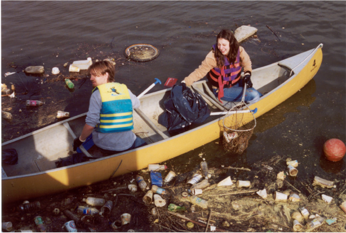
Canoe In Trash