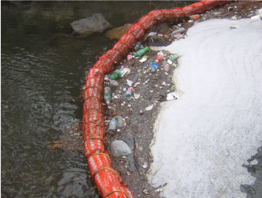
Captured Litter During Light Rain on February 4, 2006 (Sligo Creek)