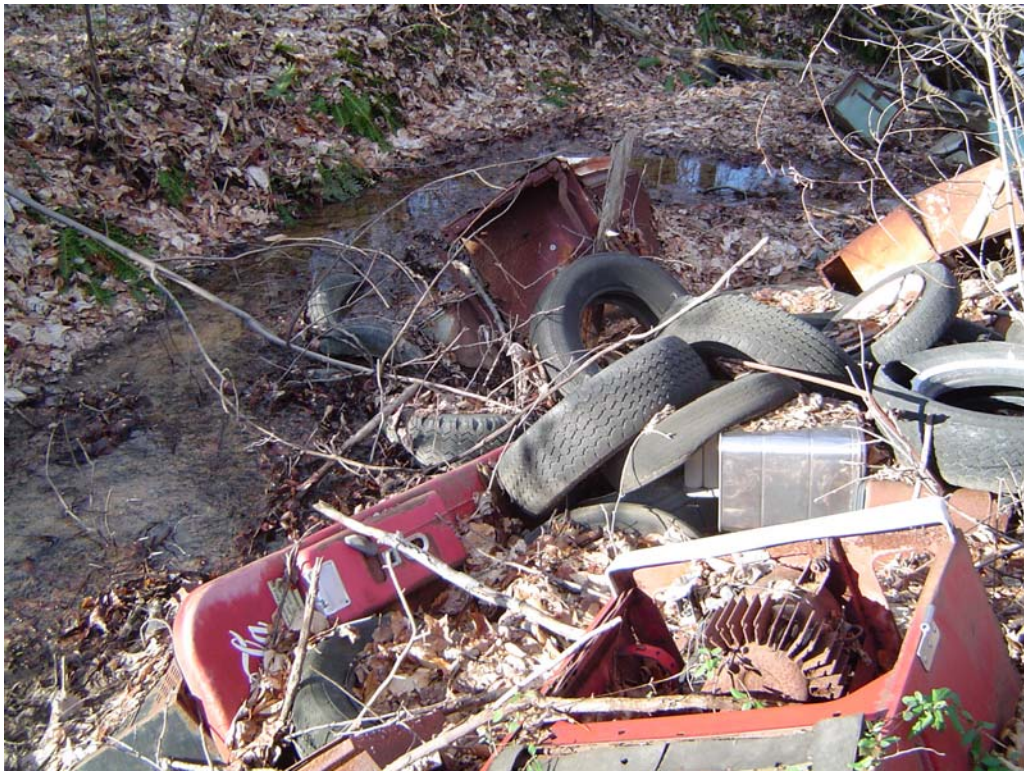
Watts Branch Headwaters