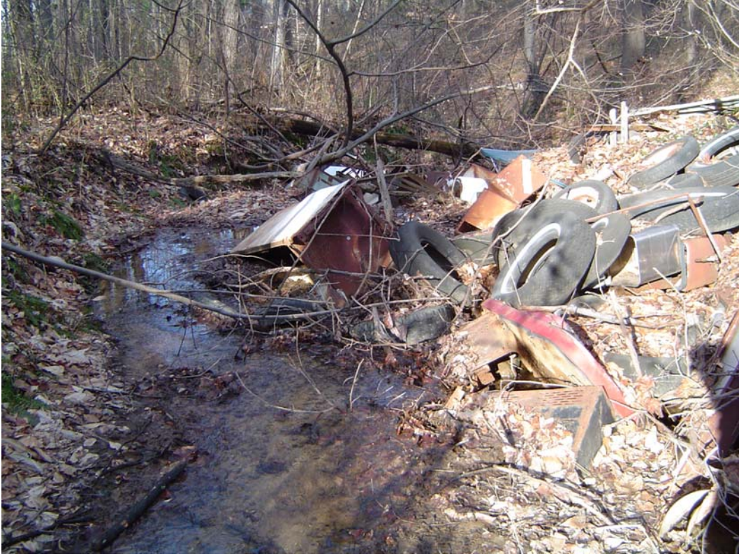
Watts Branch Headwaters