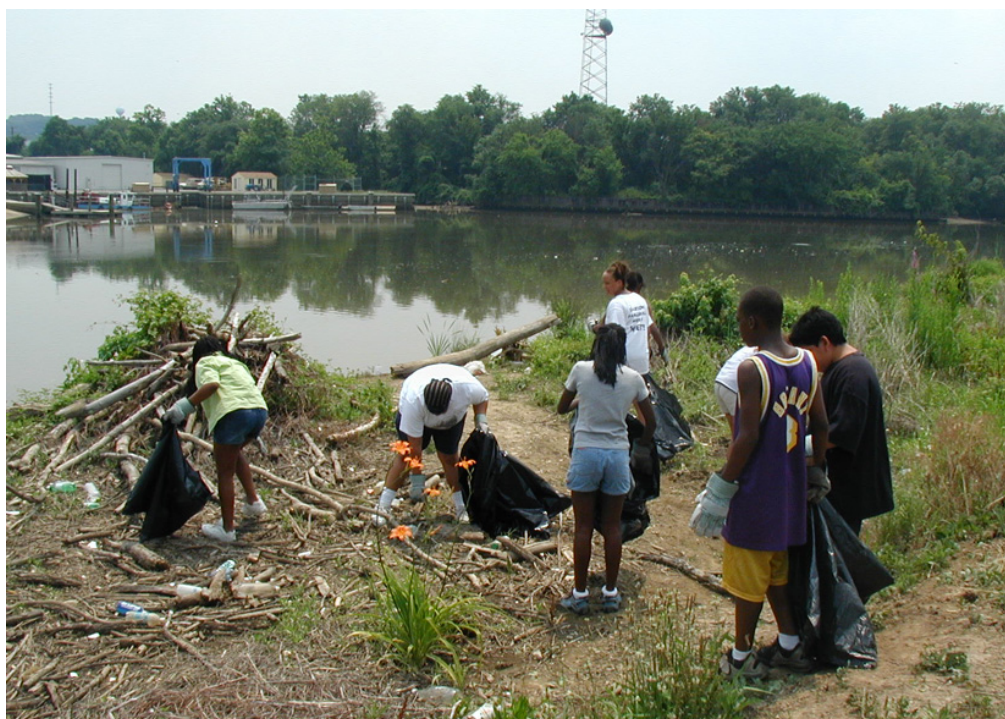
Colmar, MD Shoreline Cleanup