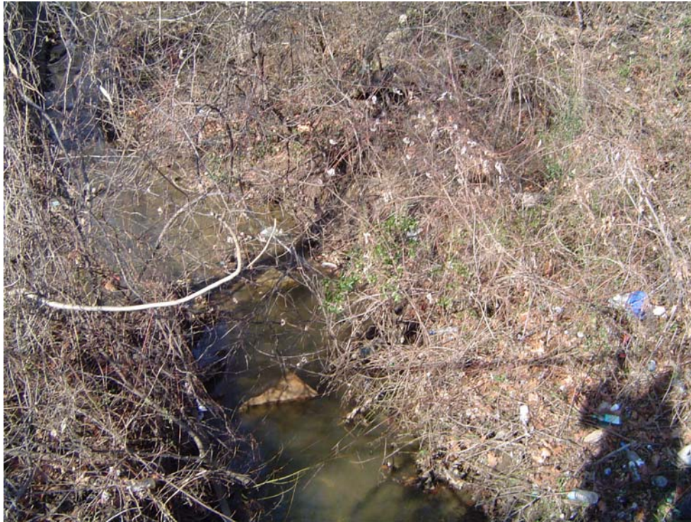
Trash on Stream Bank Near Capitol Heights Liquor Store