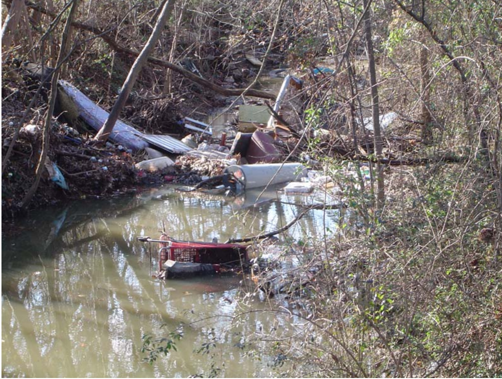
Large Trash in Stream Along Central Ave.