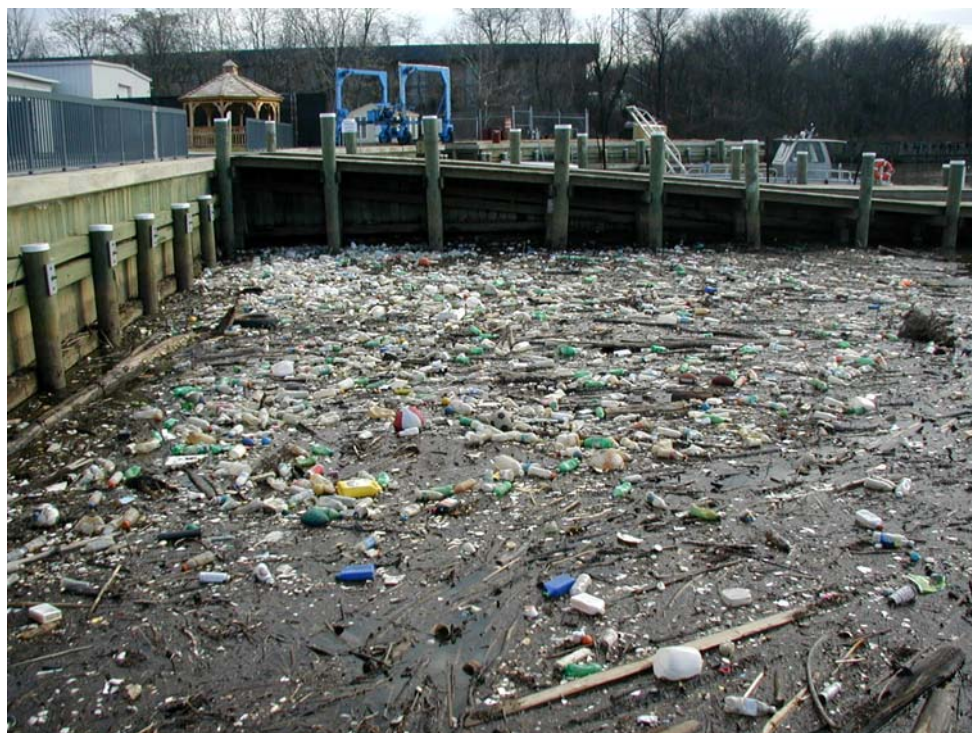
Wide Angle Toward Compound