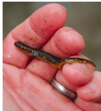
Yellow-bellied Sapsucker (left) at the Wheaton Branch ponds on Dec. 12. Northern Two-lined Salamander (above) near Sligo Creek and Wayne Ave. on Dec. 24