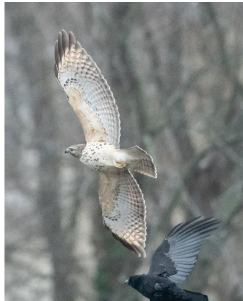
Red-tailed Hawk (above) on Dec. 11 near the Beltway ponds. Red-shouldered Hawk (right) on Dec. 20 at the Wheaton Branch ponds. Crows chase off ("mob") the hawk at right.