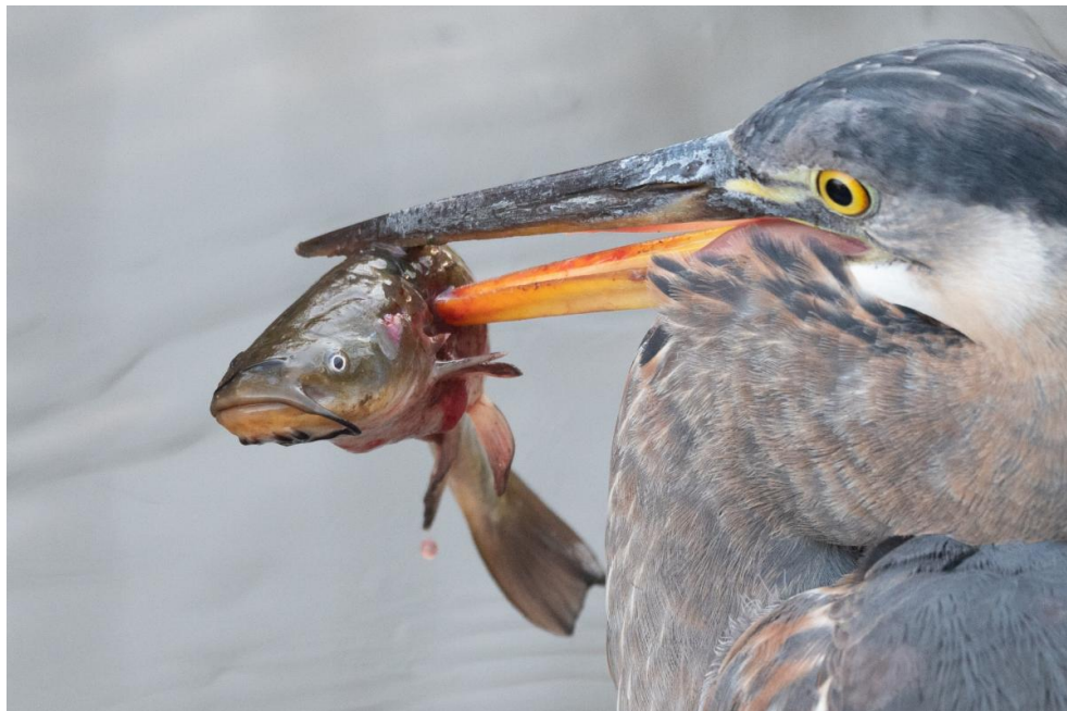
A Great Blue Heron snags a Brown Bullhead (catfish) at the Wheaton Branch ponds on Dec. 12