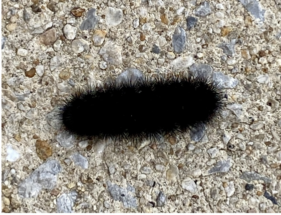
Isabella Tiger Moth caterpillar (above) near Arcola and Hoyt on Dec. 12. Virginia Wild Rye (right) in the powerline meadow on Dec. 19