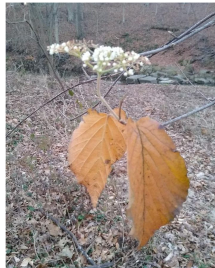
Asters (left) still flowering Dec. 12 at the New Hampshire Ave. bridge. Arrowwood viburnum (above) re-flowering on Dec. 12 just east of NH Ave.