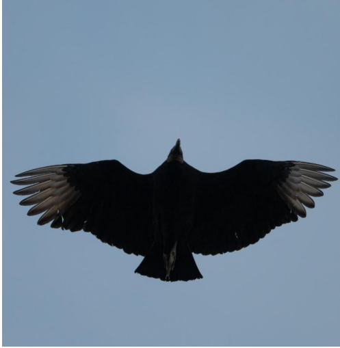
Black Vulture (above) on Dec. 22 and Pileated Woodpecker (right) on Dec. 18 at the Wheaton Branch ponds