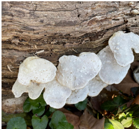
White-cheese Polypore mushroom (above) at Sligo Creek near Greenbriar on Dec. 29. Witches'-butter mushroom (right) near the Wheaton Branch ponds on Dec. 29